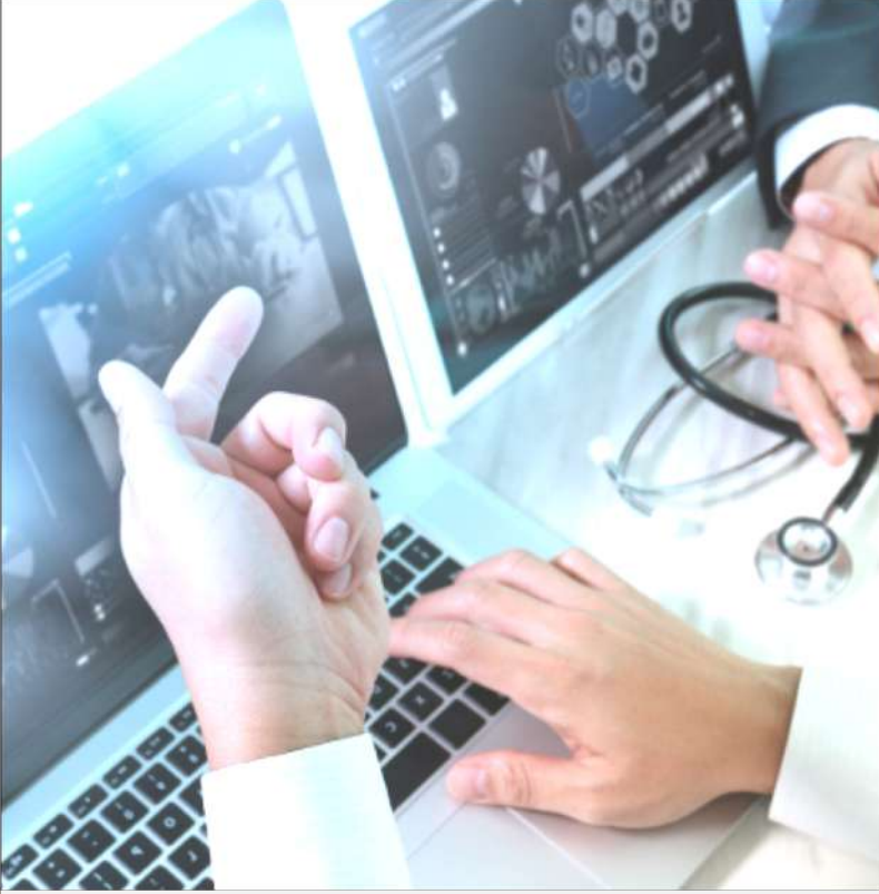
Mobile EAM for Cloud and Offline

Diversey is a brand of SealedAir Corporation. They take care of cleaning, like in hotels.